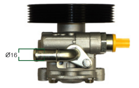
NEW PUMP - 16mm PIPE