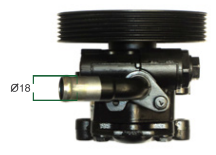
OLD PUMP - 18mm PIPE

To see what hose diameter are you needing, measure the pipe of the old power steering pump.