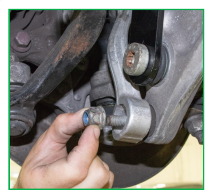
FIGURE 10 FIGURE 11

5. Install top mounting nuts. (Figure 12)