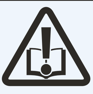
ALWAYS REFER TO MANUFACTURERS INSTRUCTIONS