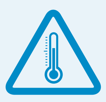
ENSURE ENGINE IS COOL BEFORE STARTING