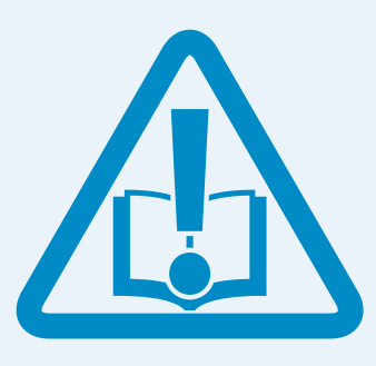
ALWAYS REFER TO MANUFACTURERS INSTRUCTIONS