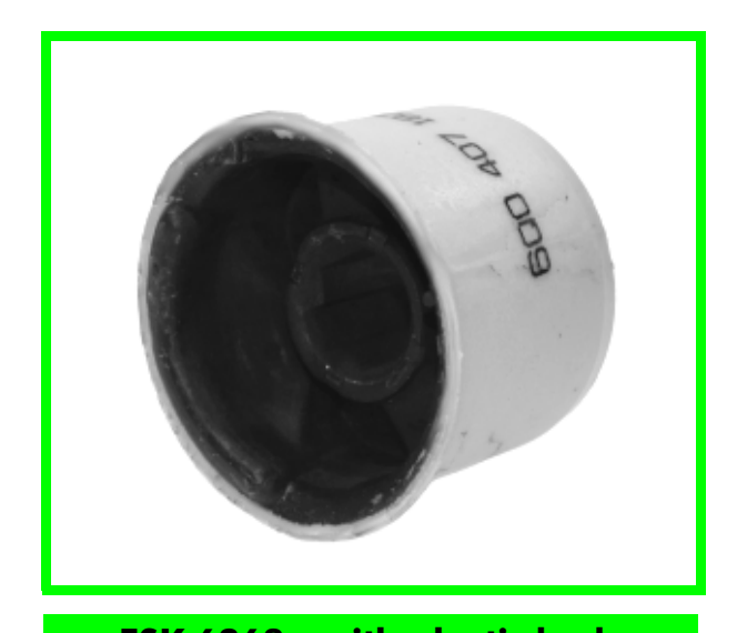
FSK 6368 - with plastic body

Enhanced steering feel and reduced brake and bump steer are additional benefits of fitting FSK 6368HD.