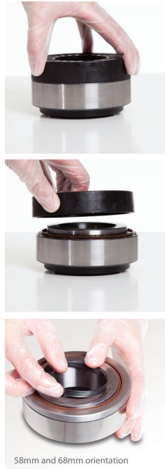
58mm and 68mm orientation

NOTE:- The Wheel-Pac Repair Kits are pre-greased and care should be taken to ensure contamination of the grease does not occur.