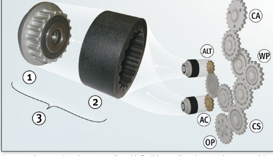
Image 1: Over-running alternator pulley with flexible coupling sleeve and spur gear drive

The vehicle manufacturer specifies a replacement interval for the over-running alternator pulley 535 o118 10 (1 – Image 1) and the coupling sleeve 535 o185 10* (2 – Image 1) in its maintenance schedule.