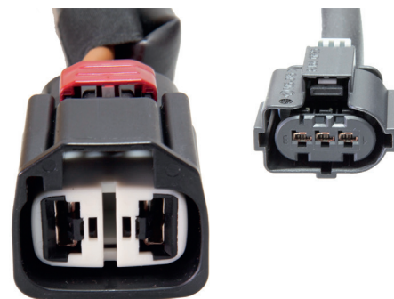
Fig. 3: New plug design