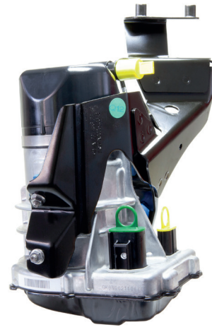
Fig. 1: JER185

If the connectors on the power steering pump that is installed in the vehicle have the old design (compare Fig. 2), then the old wiring harness must be replaced with a new one (compare Fig. 3). You can find the corresponding spare part numbers in the table below.