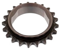
Crankshaft gear wheel SWAG 30 94 0113

Fits: 1.4 TDI engines for various models by Audi, Seat, Skoda and VW