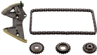
SWAG 99 13 2266

Fits: 1.4 TDI engines for various models by Audi, Seat, Skoda and VW