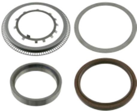
Gasket set for wheel hub febi no. 24762

to fit: Actros I+II+III+IV, Antos, Atego 18t →, Axor I+II, Integro, Intouro, O 500, O 350 / Turismo, O 530 / Citaro, O 580 / Travego, Touro, Setra Serie 4, Chassis, CBC, IBC, Multego Repl. no. 942 350 39 35