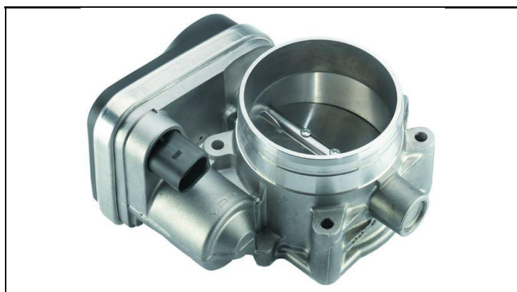
1 - Produkt / Product