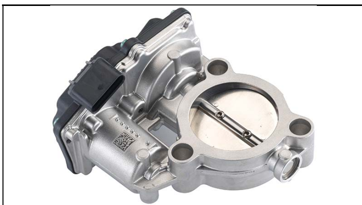
1 - Produkt / Product