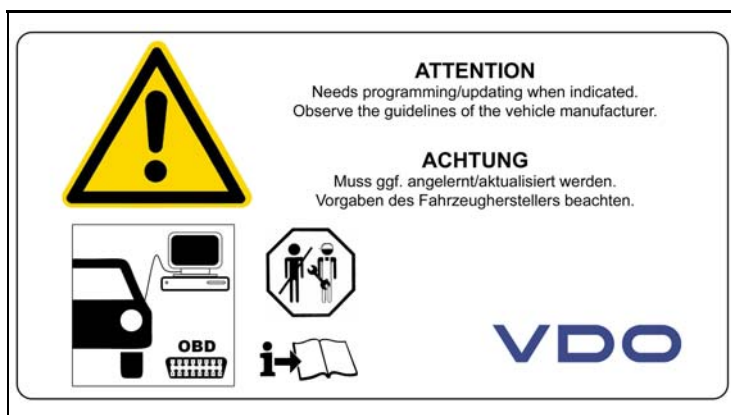
3 - Montage Hinweise / Installation Notes

Nennspannung (Motor) / Nominal Voltage (Motor) = 12 V