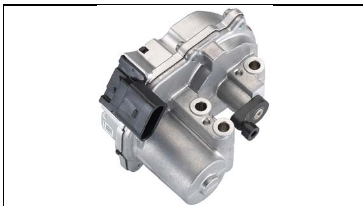
1 - Produkt / Product