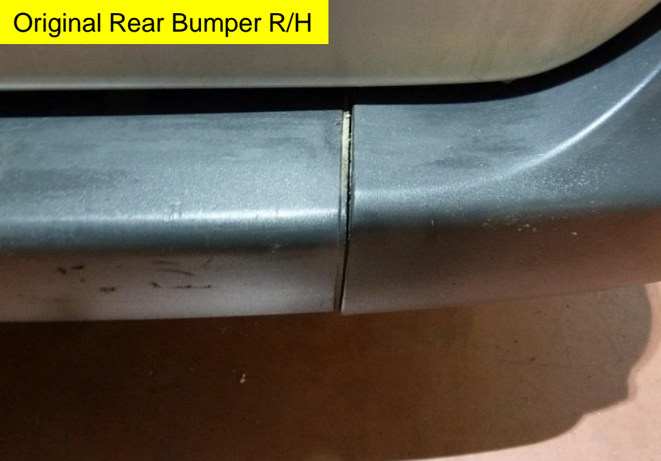
Poliplast Rear bumper R/H