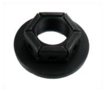
Previous SKF nut design