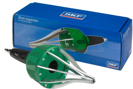
Εργαλείο διαστολής: VKN 402

Η φούσκα VKJP 01018 είναι κατασκευασμένη από υλικό μεγάλης ελαστικότητας και μπορεί να τοποθετηθεί εύκολα και γρήγορα με το ειδικό εργαλείο αέρος VKN 402, χωρίς την εξαγωγή του μπιλιοφόρου από τον άξονα.