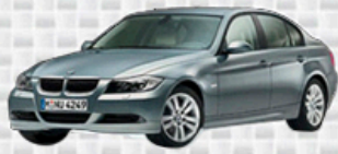
Berline 4 door E90

Particularity of front shock absorbers ref. E7070 and E7072