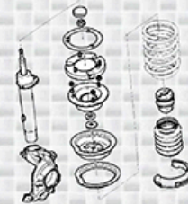
Exploded view of all

Tightening torque : Rod nut : 6.4 da N.m Lower mounting : 8.1 da N.m Stop Mounting kit screw : 3.4 da N.m