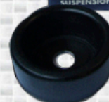
Rear axle bearing Monroe® Reference L15806