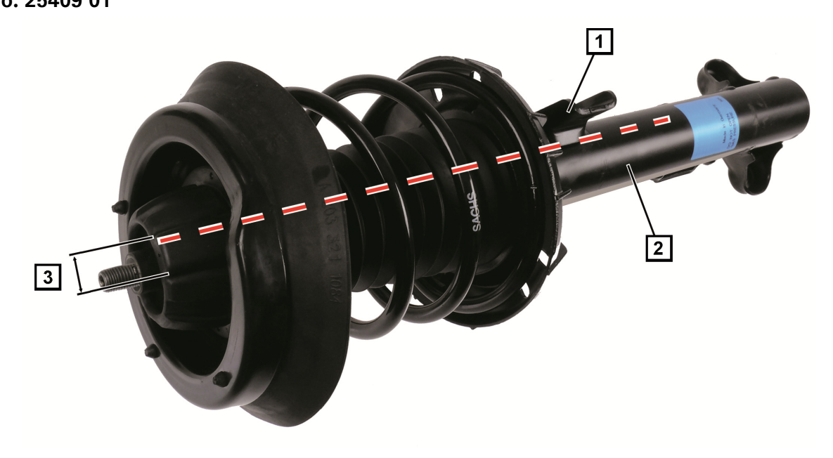
Fig. 1: Suspension strut

Mercedes-Benz C-Class (CL203 / S203 / W203) Mercedes-Benz CLK-Class (A209 / C209) Item no. 25409 01