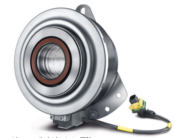
Concentric pneumatic clutch actuator CPCA

After installing a concentric pneumatic clutch actuator, it must be recalibrated using a suitable diagnostic device (e.g. Jaltest by COJALI). Without calibration, the clutch will grab when starting off and the vehicle will be difficult to manoeuvre under load. In addition, various error messages will be displayed on the vehicle information display.