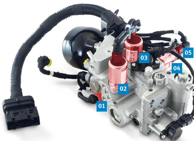
01–05 Five control valves (highlighted in red) on Selespeed manual gearbox

For this reason, it is not permitted to interchange the control valves.