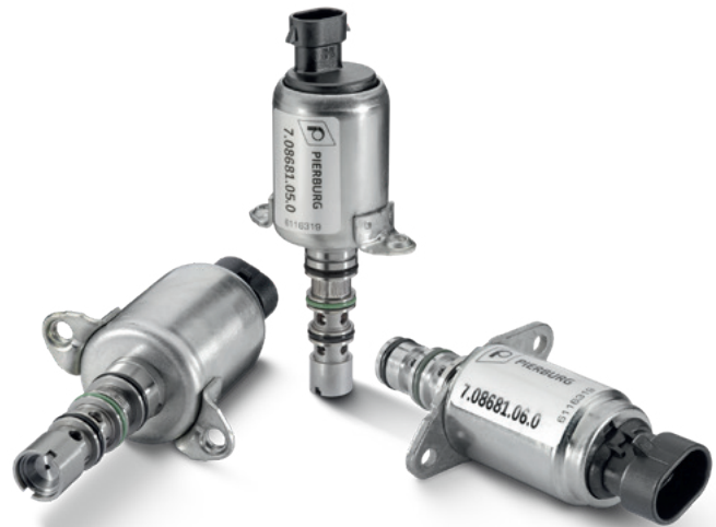
Control valves (selection)

The Motorservice control valves allow repairs that reflect the vehicle's current value, without the need to replace the entire control gear.