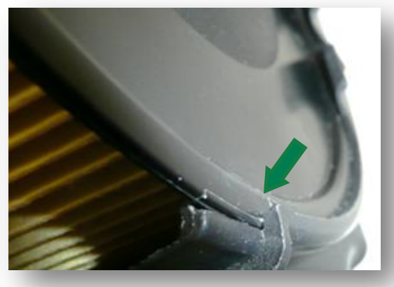
2 Ensure that the edge of the element base completely fits into the groove of the housing.