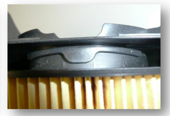
4 The element seal has to be situated behind the housing lip.