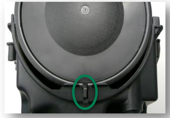
1 When inserting the filter element ensure that the alignment contour is correctly placed into the notch provided.

Changing the MANN-FILTER C 16 134/1 is quite easy, so long as a couple of points are observed on installation: